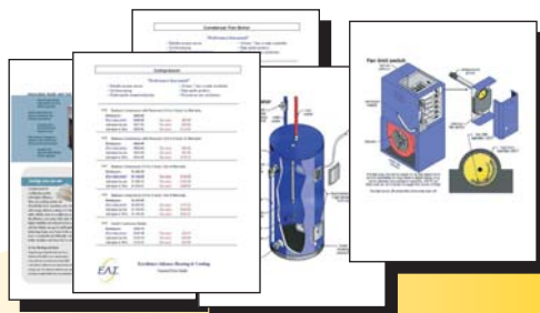
Full color book including diagrams and sales materials

Excellence Alliance is the premiere alliance of independent contractors. Our mission is to help independent contractors achieve sustainable growth and profitability.